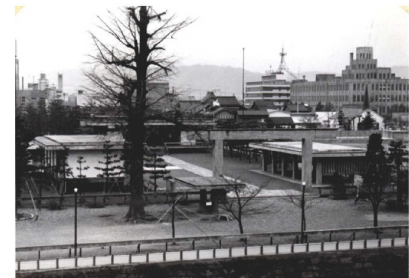
Fig.3 Architect T.Igarashi and Fukui-jinja-Shrine