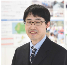
Dr. Eng. / Professor

Earthquake hazard assessment, MEMS sensor, Structure monitoring