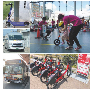
Fig.1 Situation of Car-Free Days and various of transportation

Especially in local cities in Japan, evolved into societies and cities that rely on cars excessively has been done in the past. In the future, it is important to make a paradigm shift. Because in Japan, the decrease of population and the super-aging the future. In this study, we have been tackling of "community building by Transportation "centered on green transportation(Bicycle traffic and public transportation, etc.), which is focused on people, with an eye on 30 or 50 years from now. We are pursue that what is mobility for more satisfy at modern life. Therefore, We make survey into awareness of use by the residents at the introduction of Bus Trigger System, and potential at urban planning through bicycle in regional cities, etc.