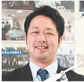
Doctor of Engineering / Associate Professor